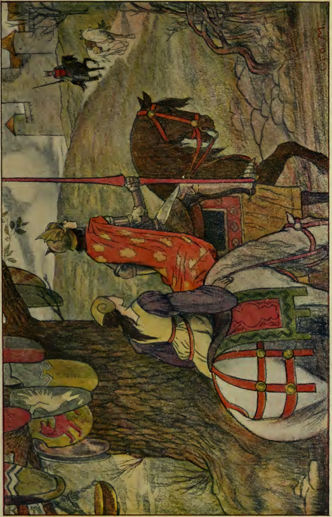
SIR LANCELOT AND SIR TURQUINE.